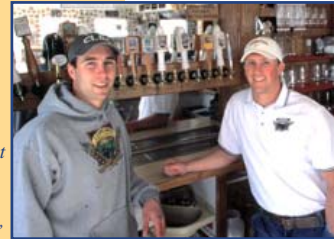
Cascade Lakes Brewing Company Co-Owner

"The thing that I love the most about being in the brewing industry is the relaxed nature of the business. It's not cutthroat and it seems that all the craft breweries work together, sharing information and ideas."