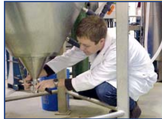
Pacific Foods of Oregon Product Development Specialist