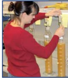
E & J Gallo Winery Fermentation Microbiologist