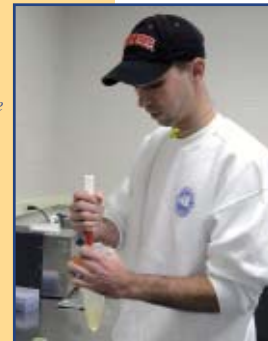
Tillamook County Creamery Association Quality Assurance/Special Projects Mgr

"I find my work very rewarding and if there is one piece of advice I can give, it would be: once you find something you like, stick with it. Although I gained valuable experience working in the production departments, I have found the quality assurance department to be my passion."