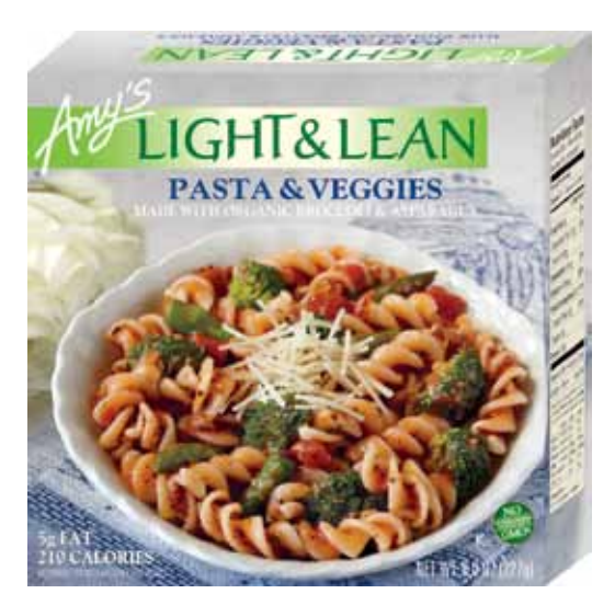
Amy's Light & Lean low-fat, low-calorie entrees typically contain just 4 or 5 Weight Watchers Points and have a suggested retail price of $4.89.