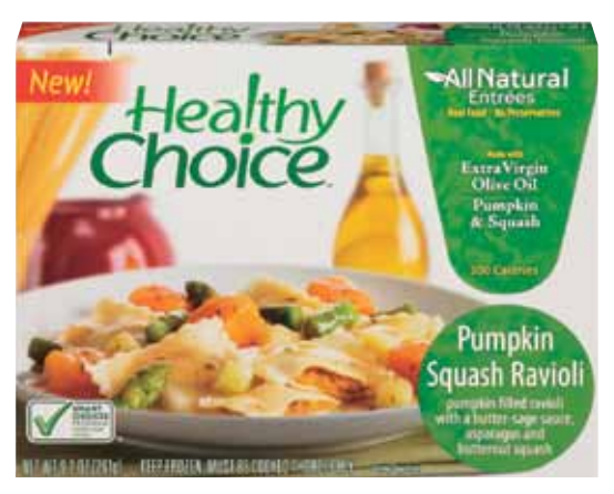
Pumpkin Squash Ravioli was one of the new additions when ConAgra contemporized its Healthy Choice line in spring 2009.

options that have come up in the past 10 years," says Browne. Inexpensive fast-food meals also compete with frozen dinners and entrees, he adds.