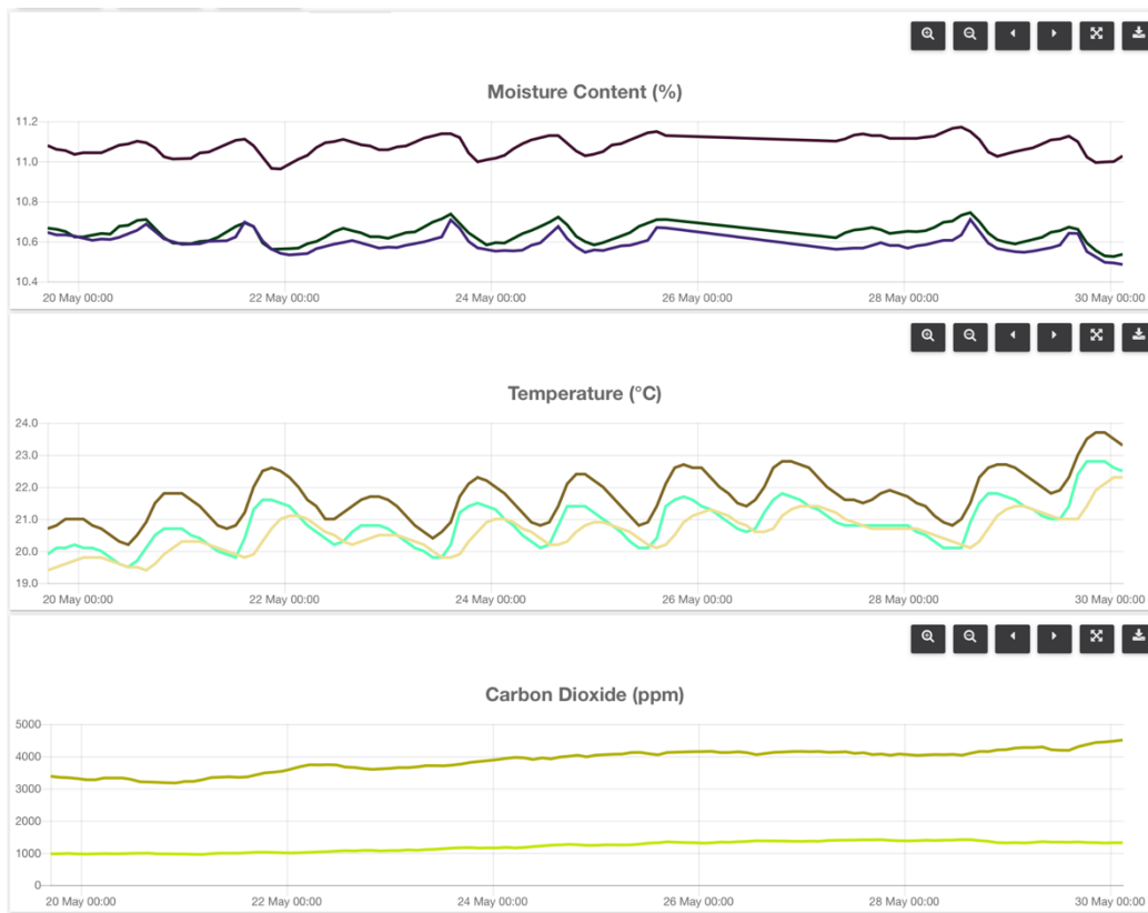
Figure 2: Monitoring of conditions with sensors in grain (available at centaur.ag )

methods based on NIR spectrometry . Portable spectrometers are now available that enable scanning and transmission of crop fingerprints. The same technology can be employed further downstream, say at a flour mill, to validate the provenance of incoming grain and propagate the chain of traceable CTEs.