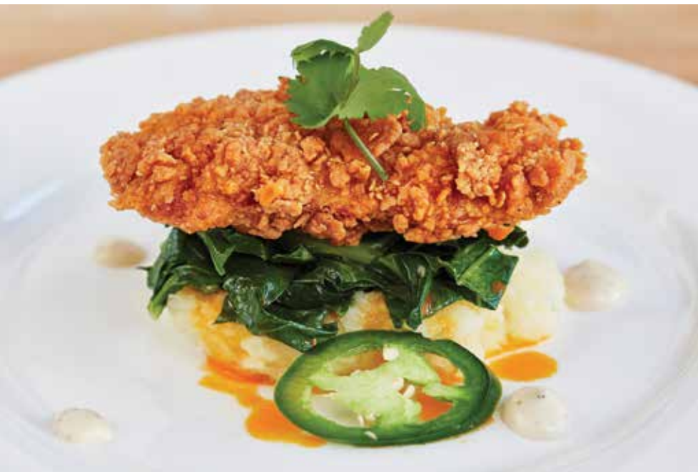
Memphis Meats last year unveiled chicken made by growing animal cells, which the company says is the first time that poultry has ever been produced with this method.

production method does not rely on shuttling calories through the metabolizing, moving, breathing, heat-generating body of an animal in order to obtain a small fraction of those inputs as meat. At scale, production of clean meat is predicted to be inherently more sustainable than current industrial animal agriculture.