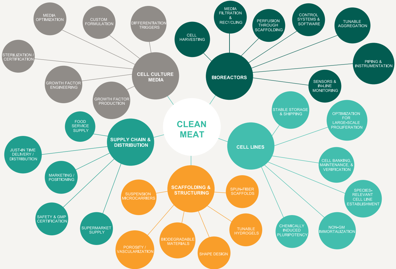
Figure 1. This conceptual mind map illustrates the primary elements for development and production of clean meat at large scale. Illustration courtesy of The Good Food Institute

quantities of cells multiply. Initially, donor cells are harvested from an animal either through live biopsy, immediately after slaughter, or from an embryo. After the initial harvest, there are a number of methods for sustaining the cells' capacity to proliferate continuously, thereby reducing and ultimately eliminating the need to isolate new cells. Companies are exploring several types of cells in various stages of differentiation to determine which cells exhibit optimal performance for both proliferation and maturation into the desired final cell types.