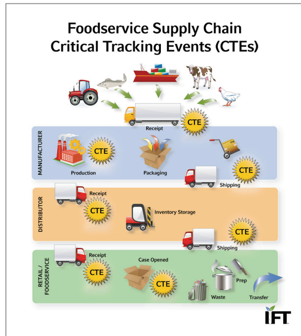
Process depicted is used with permission of UFPC/Yum! Brands, Lexington, KY.

This concept requires that the supply chain be evaluated as a whole — from the beginning of each product or ingredient through all handlers and all stages of processing, ideally to the final consumer. Currently several industries are examining what CTEs comprise their supply chains.